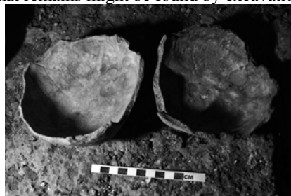
Fig. 5: Fragments of two human skull caps found in the Wolf Den in the west passage.

Bones, presumably carried in by predators, were found throughout the cave but were particularly concentrated at the extreme western end of the system in the same place (the Wolf Den) where growls were heard. From among many bones lying on the surface, a human skull, two human skull-cap fragments (Fig. 5), one particularly large animal bone and one springy, curved stick were collected, removed from the cave and radio-carbon-dated. The results are shown in Table 1. One of the human skull fragments was dated at 4040±30 years BP and the still unidentified animal bone (Fig. 6) was found to be 2285±30 years old. Since these items were found lying on the surface of the sediment layer covering the original floor, it is speculated that still older human and animal remains might be found by excavations carried out by competent investigators.