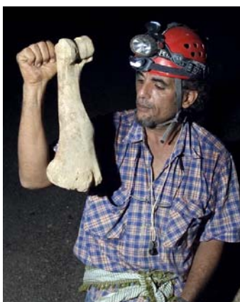
Fig. 6: This bone, over 2000 years old, is still awaiting identification.