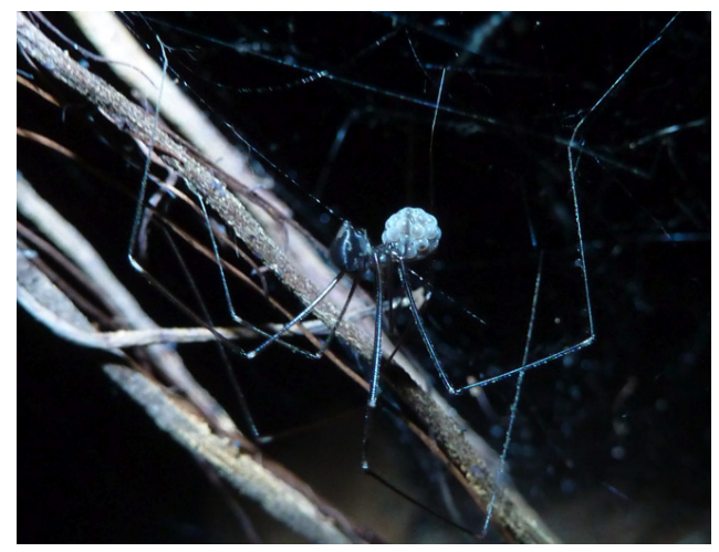
Fig. 19. Long-legged spider, possibly a pholcid, manipulating egg sac bundle along its silken web strands amidst tree roots in Pinwill Cave. (photo: Arthur Clarke, 13 August 2010)

How was the collection performed, i.e. under what auspices (expedition; private visit; specific research project; post-grad degree project)?