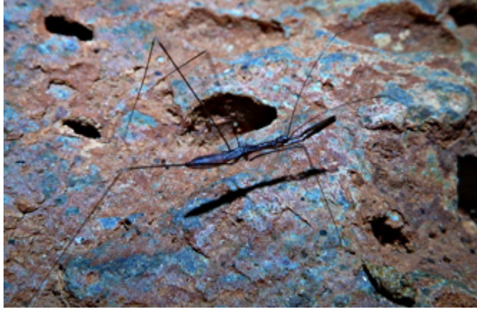
Fig. 14. Hemipteran reduviid bug, in Pinwill Cave (photo: Arthur Clarke, 13 August 2010)

Amongst the many undescribed troglobites from Undara there are the numerous centipedes (e.g., Fig. 13), millipedes and spiders (Figs. 19, 20), plus pseudoscorpions (Fig. 8), schizomids, isopods (Fig. 2), springtails, curculionid weevils, thysanura (silverfish or bristletails) and cockroaches (see below). There are a number of other likely troglobites including carabid and staphylinid beetles, thread-legged emesine reduviids and dolichoderine or formicine ants (Formicidae). The known described species fall into four groups: cockroaches, reduviid bugs, spiders and planthoppers.