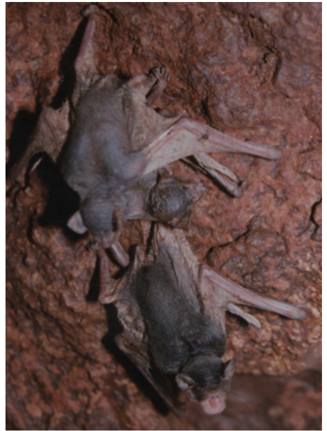
Fig. 10. Huddling together for warmth, with minimal hair covering and still unopened eyes, these juvenile bats were photographed by Arthur Clarke on 7 Jan. 1989, at the edge of a maternity site on the wall above the lake in Barkers Cave; a former lake level is just discernable near the bat's left ear.

and the pythons at the cave entrance and to sample epigean (surface) species found in the forest litter near (just outside/inside) the cave entrance. The collected entrance species include several beetles: Australobolbus sp. (Scarabaeoidea: Bolboceratidae), two tenebrionids: Pterohelaeus and Ommatophorus sp. and an undetermined scarab beetle (Scarabaeoidea: Scarabaeidae: Melonthinae); a cicada Illyria burkei (Hemiptera: Cicadidae); a hemipteran bug Diplonychus (Hemiptera: Belostomatidae), a termite: Mastotermes darwiniensi (Isoptera: Mastotermitidae); Polistes sp. wasps (Vespidae); Anochetus sp. ants (Ponicerinae); and undetermined tabanid horse flies. Collected species from within Barkers Cave included cockroaches. isopods, millipedes, dolichoderid ants and a chrysomelid beetle (Chrysomelidae: Galerucinae). The few species collected from Pinwill Cave on 8 January include some undetermined but spinose and setose cave-adapted spiders, pholcid spiders, guanophile mites, an unknown reduviid bug, tineid moths, histerid beetles, an undetermined Psocoptera and a range of undetermined ants.