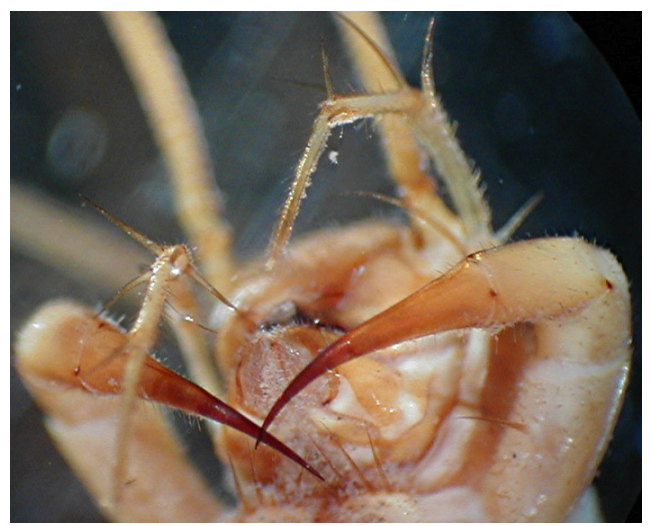
Fig. 15. Photomicroscopy image taken by Arthur Clarke, showing head and forelimbs of an undescribed blind centipede collected from Bayliss Cave on 6 January 1989. The sharply pointed, highly sclerotinised and modified spines, suggest this is likely to be another troglobitic species.