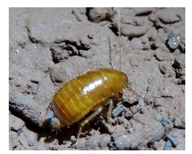
Fig. 18. Possibly a blattellid (and possibly a new species of Neotemnopteryx ), this fast moving and apparently blind and quite setose cockroach carrying its egg sacs and scurrying across the floor of Pinwell Cave, was photographed by Arthur Clarke on 13 August 2010.

QM (Queensland Museum) in Brisbane, e.g., spiders, insects, gastropods, centipedes, etc.