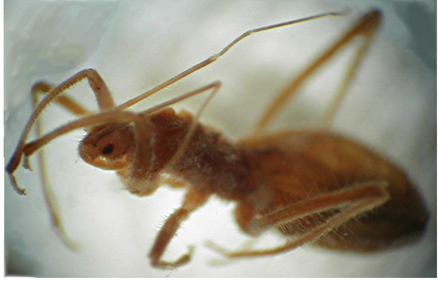
Fig. 5. With reduced eyes, this setose hemipteran bug from Bayliss Cave, described by Malipatil and Howarth (1990) is considered to be a troglobitic (cave-adapted) species (Howarth and Stone 1990).

Howarth, Stone and Bresnan collected a possibly troglobitic \delta spider: Australutica sp. (F. Zodariidae), specimen KS-34401 (Australian Museum records, 2011) previously recorded in Gray (1989) as Storena