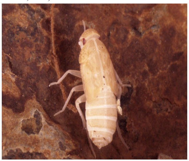
Figure 16:. Photograph of the troglobitic planthopper Undarana collina from Collins Cave; from a transparency taken March 1997 by Paul Zborowski; image scanned 20 January 2011.

2001) (see Fig. 7). Additional troglobitic, but still undescribed, species from Bayliss include: Nesticella sp. 1 (Nesticidae) and Australutica sp. (Zodariidae) (Gray unpublished; 1989; Howarth and Stone 1990; Bannink in prep; Australian Museum records 2011). Possibly adapted, but nevertheless troglophilic, spiders include Heteropoda sp. (Sparassidae) from Barkers Cave (U-34) and Darcy Cave (U-31), Heteropoda alta (Sparassidae) from Michaels Cave, Nesticella sp. 2 (Nesticidae) and Spermophora sp. nov. B (Pholcidae) (Gray, unpublished; 1973; 1989; Australian Museum records, 2011).