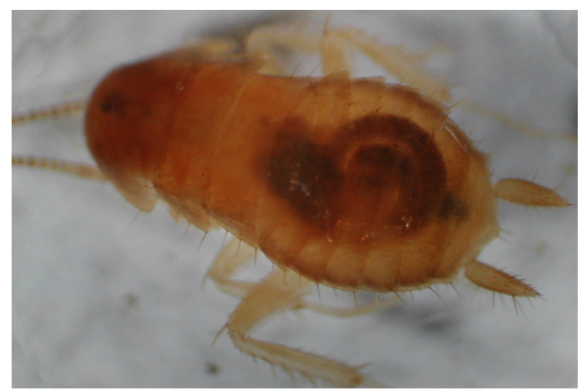
Fig. 13. Photomicroscopy image of the translucent body of a blind cockroach collected from Bayliss Cave on 6 January 1989. Although probably an immature specimen of Paratemnopteryx or Neotemnopteryx , this juvenile might be Nocticola , species of which are referred to as "nockies" by Fred Stone.

species, many of which are undescribed and/or endemic to these systems. This includes isopods of the Superfamily Oniscoidea, spiders of Family Pholcidae (Spermophora sp. nov. B), Family Zodariidae, Family Nesticidae and a sightless hunting spider of unknown affinity, two species of Polydesmida, centipedes (Chilopoda: Scutigeromorpha), silverfish (Thysanura), cockroaches (Family Blattellidae), two species of assassin bugs (Family Reduviidae) and a number of beetles (Family Staphylinidae) (Gray 1989; Howarth 1988)..." (QPWS, 2000).