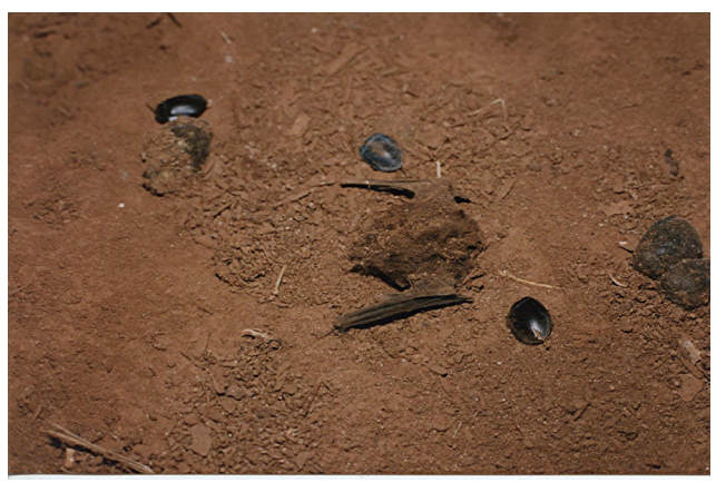
Fig. 12. Marauding scarab dung beetles (Omorgus sp.) near bat carcass and dung on dirt floor of Barkers Cave; note the dried skeletal remains of bats. (photo: Arthur Clarke, 7 January 1989)

collection of P. stonei cockroaches, taken from seven caves, with over half of these (89 adults) taken from two caves at Undara: Barkers Cave (16 \triangleleft and 25 \heartsuit ) and Bayliss Cave (21 \triangleleft and 27 \heartsuit ) (Slaney & Weinstein 1997). The adults were subsequently examined and dissected by Slaney and Weinstein to ascertain the geographical variation in different troglomorphic adaptations between cave populations, e.g., eye width, eye length and tarsus (foot) length. In late July 1995, Messrs. Irvin, Slaney and Stone, plus Debbie Ward collected other cave-dwelling invertebrates from Nasty Cave and Pinwill Cave (Stone 2010).