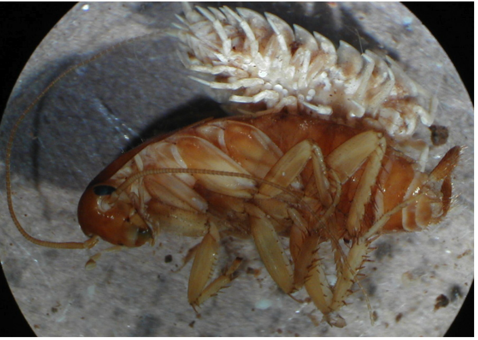
Fig. 2. Photomicroscopy image of Paratemnopteryx stonei "Race C" variant (Roth 1990) with a blind isopod, both collected from Barkers Cave by Arthur Clarke, 6 January 1989.

The first speleological exploration of the Undara lava tubes was primarily undertaken by Brisbane-based members of the University of Queensland Speleological Society, evidenced by early survey maps of The Arch, Barkers, Daves, Ewamin, Picnic and Stephensons Caves etc by Dwyer in 1968, plus Hanson and Taylor caves by Ken Grimes in 1977 (Grimes 1977; Godwin 1993). Dwyer was also involved with studies of lava tube dwelling populations of bats at Undara during the early 1970s (Godwin 1993).