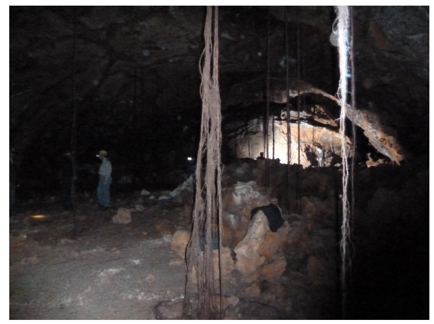
Fig. 1. Looking towards rear of Pinwill Cave main chamber, showing the tree roots which provide a habitat, source of food and moisture for tropical cave species such as beetles, bugs, cockroaches, isopods, planthoppers (Figs 3 & 16) and spiders.

coincidental, the second wave of major study and collection at Undara followed immediately after the ASF "Tropicon" Conference held at Lake Tinaroo near Atherton, in late December 1988.