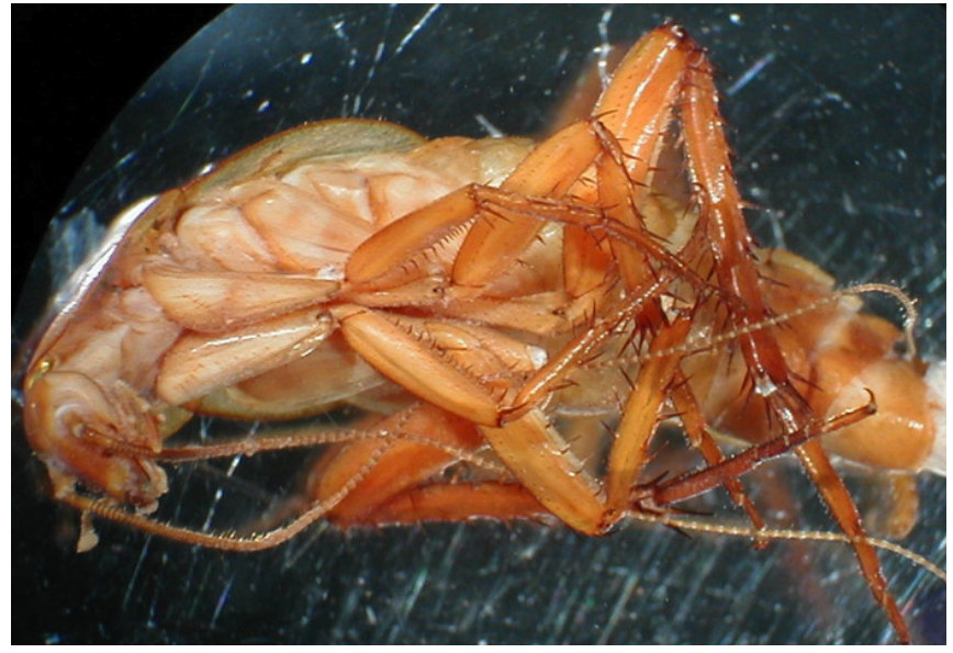
Fig. 4. Latero-ventral view of the blind cockroach ( Neotemnopteryx baylissensis ) from Bayliss Cave collected 6 January 1989 by Arthur Clarke.

specimen was later used as the holotype in description of Solonaima baylissa (Hoch & Howarth 1989b); see Fig. 3. On 23 May 1985, Howarth, Irvin and Stone collected two more \bigcirc and a \bigcirc of the P. stonei B variant, plus the first two specimens (a \bigcirc and nymph) of a blind cockroach (Roth 1990). Initially described by Roth simply as Paratemnopteryx sp. 4, this blind species was subsequently re-described as Neotemnop teryx baylissensis , following the discovery of four additional specimens in Bayliss and a \bigcirc in Kenny Cave (Slaney, 2000). During this same three-day period (May 21-23), Howarth, Stone and Irvin collected two \bigcirc of a cave-adapted reduviid hemipteran bug in Bayliss Cave; both specimens were subsequently used as