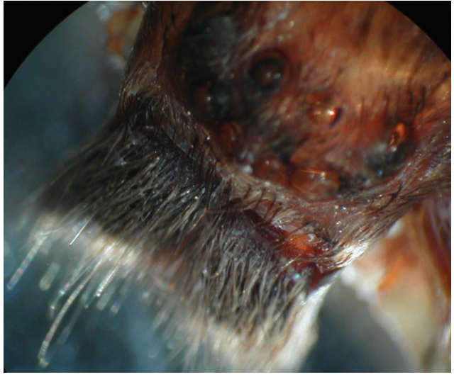
Fig. 17. Photomicroscopy image depicting the head of a new undescribed spider, possibly ?Nesticella sp. from Pinwill Cave. The eyes (without pigment) would appear to be non-functional and with the dense matt of sensory hairs (looking like a paint brush) at the front of its head and the antenna-like spines, it is likely to be a troglobitic species.