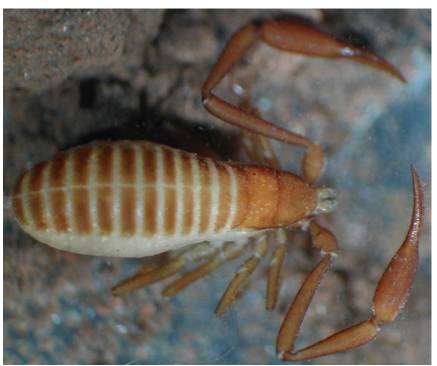
Fig. 8. Blind cheliferid pseudoscorpion ( Protochelifer , near P. cavernarum ) with long but powerful pedipalps, collected from Wind Tunnel by Arthur Clarke on 7 January 1989; still (unregistered) in QM.

Barkers Cave and Bayliss Cave were inspected, sampled and photographed by Clarke and Williams on 6 January 1989. The collected specimens from Barkers Cave include a number of adult and juvenile cockroaches, presumably the Paratemnopteryx stonei (Race C) variant, often underneath clusters of bats (see Fig. 10) and found in abundant numbers on the guano covered lava tube walls (Fig. 11); a hemipteran reduviid bug: Coranus sp., undetermined ants (Formicidae: Dolichoderinae) and weevil beetles