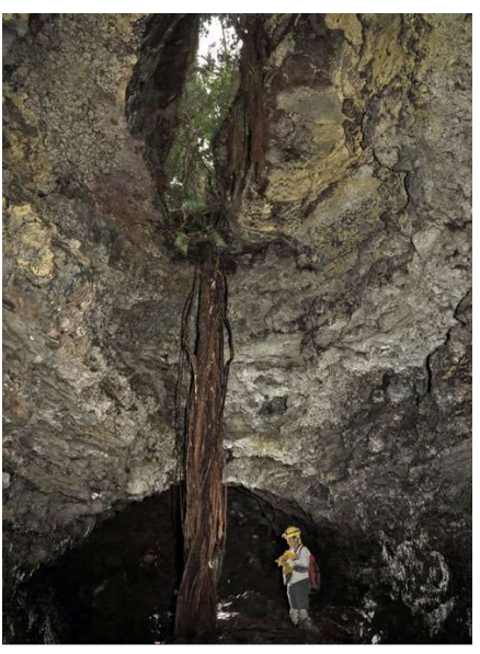
Skylight with tree roots along with golden slime (microbes) on ceiling.