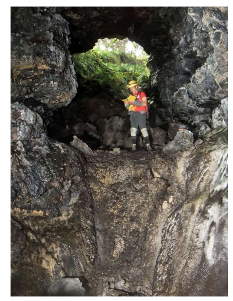
Just one of the many lava falls and puka entrances to the cave system.