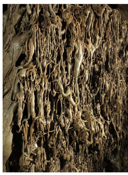
Splatter formations in an area called the "Spaghetti Factory".